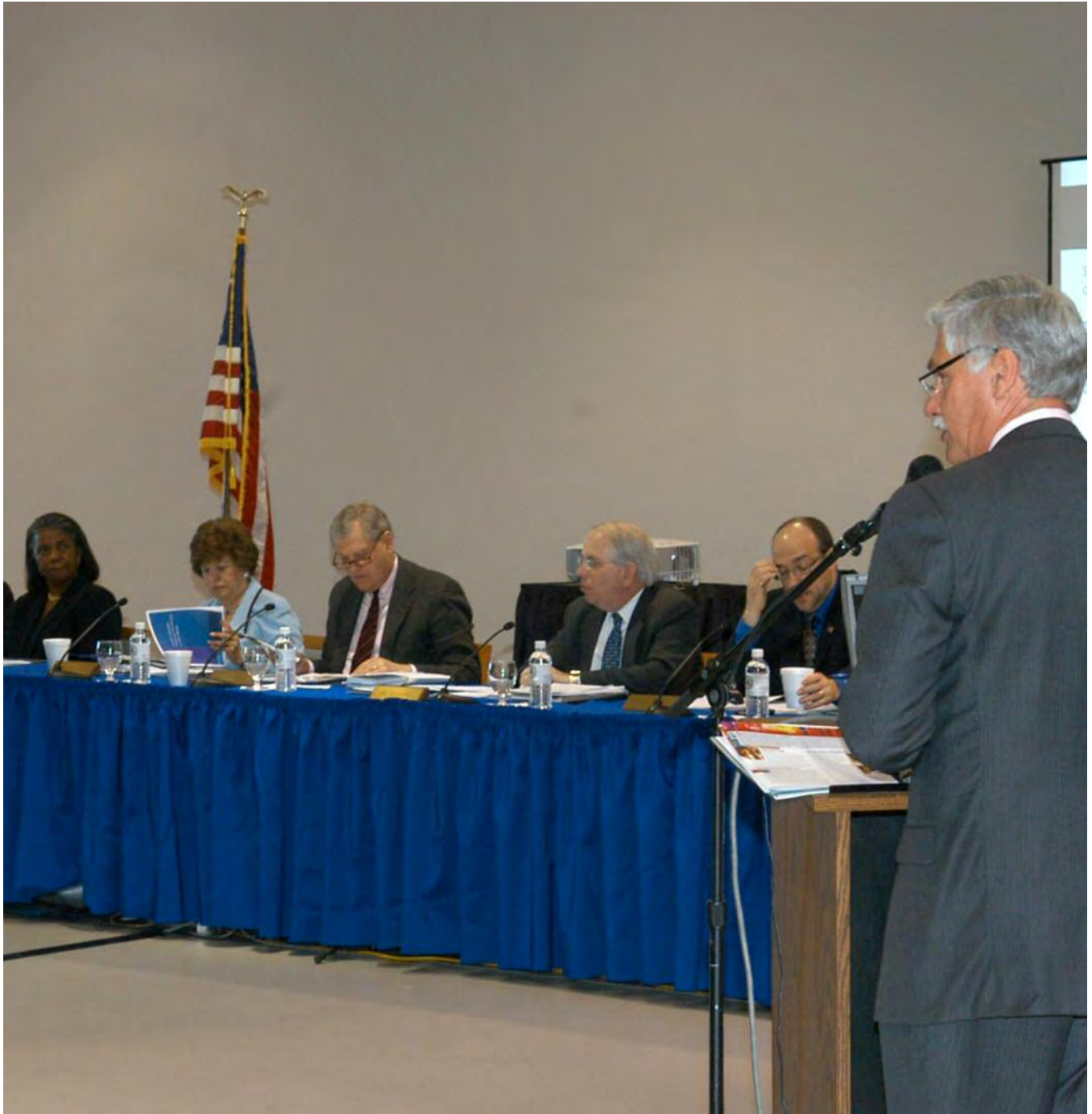
Photograph by Deborah Rexine