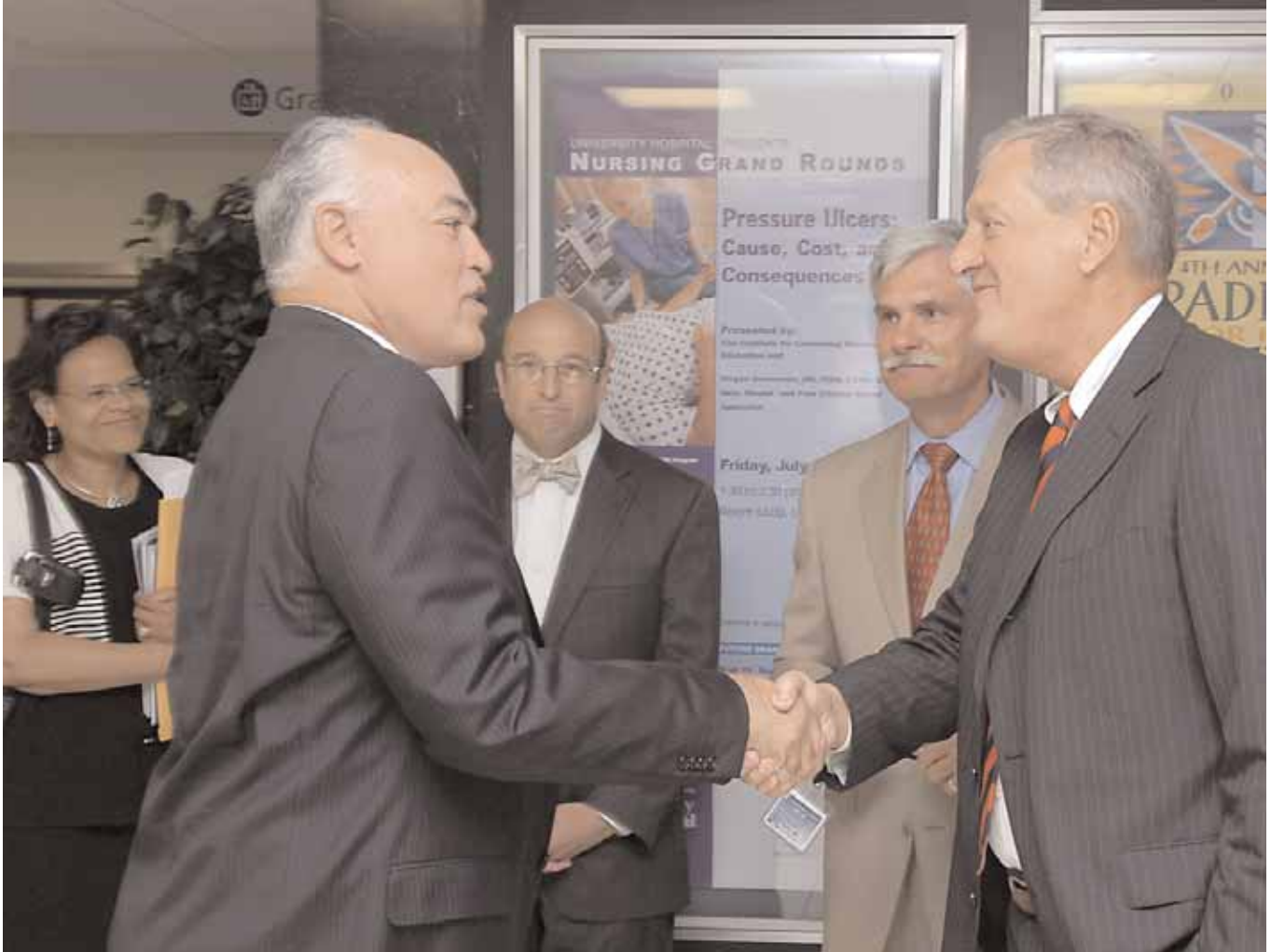
Photograph by Deborah Rexine