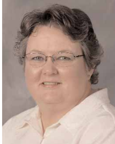
Marybeth Albert Designated AIDS Center