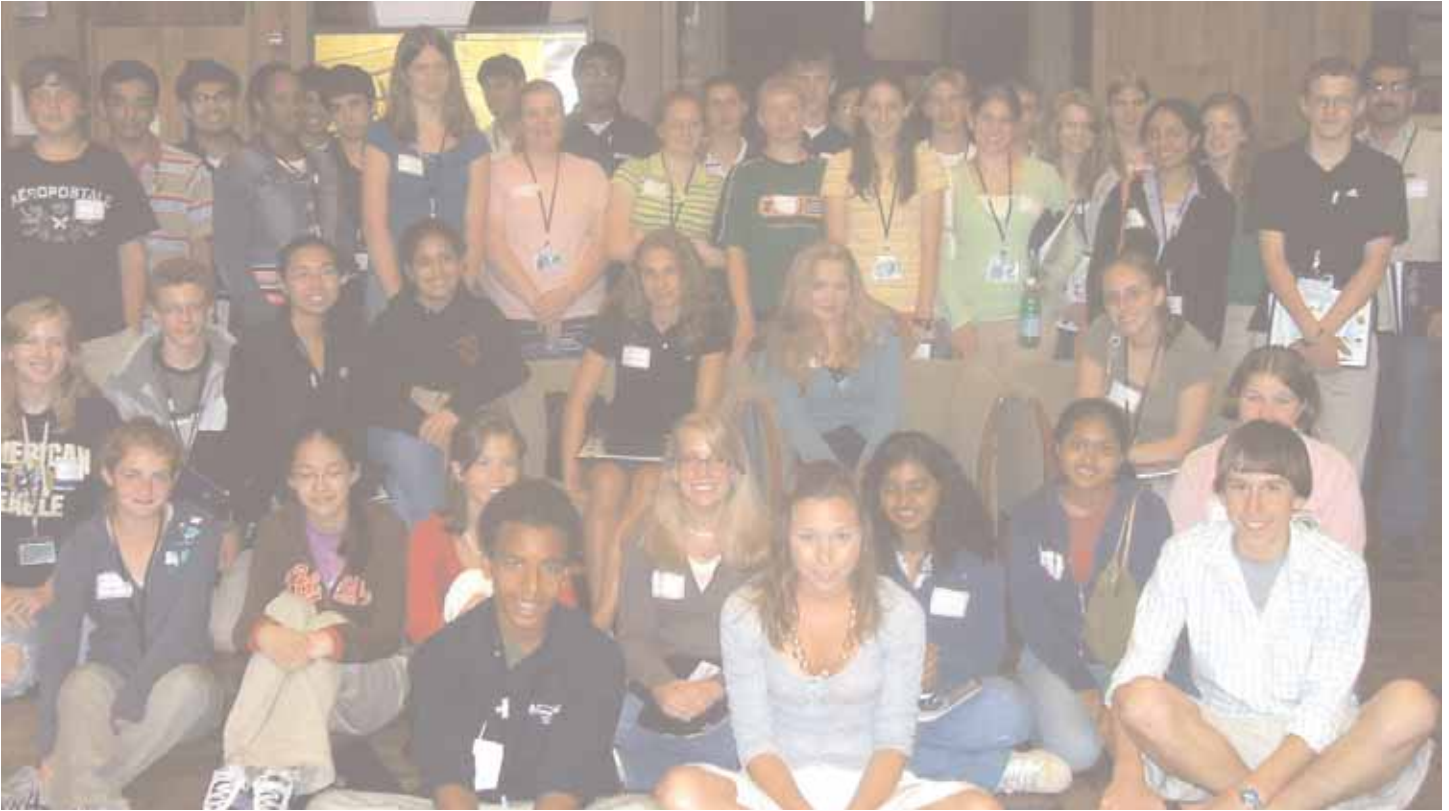
University Hospital's 2006 teen volunteers