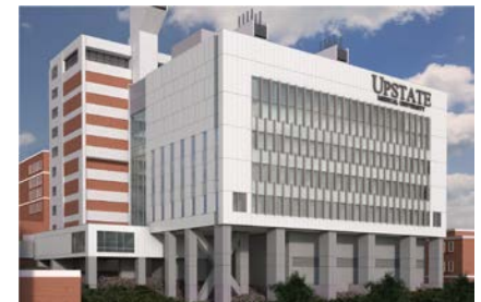
The New Academic Building