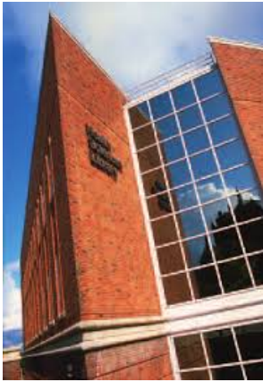
Health Sciences Library