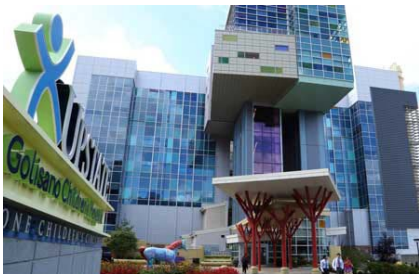
Golisano Children's Hospital