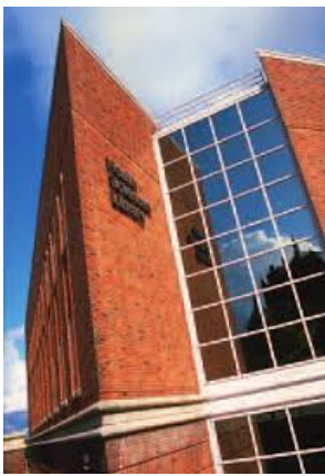
Health Sciences Library

Colleges of: Medicine • Health Professions • Nursing • Graduate Studies