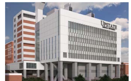
The New Academic Building