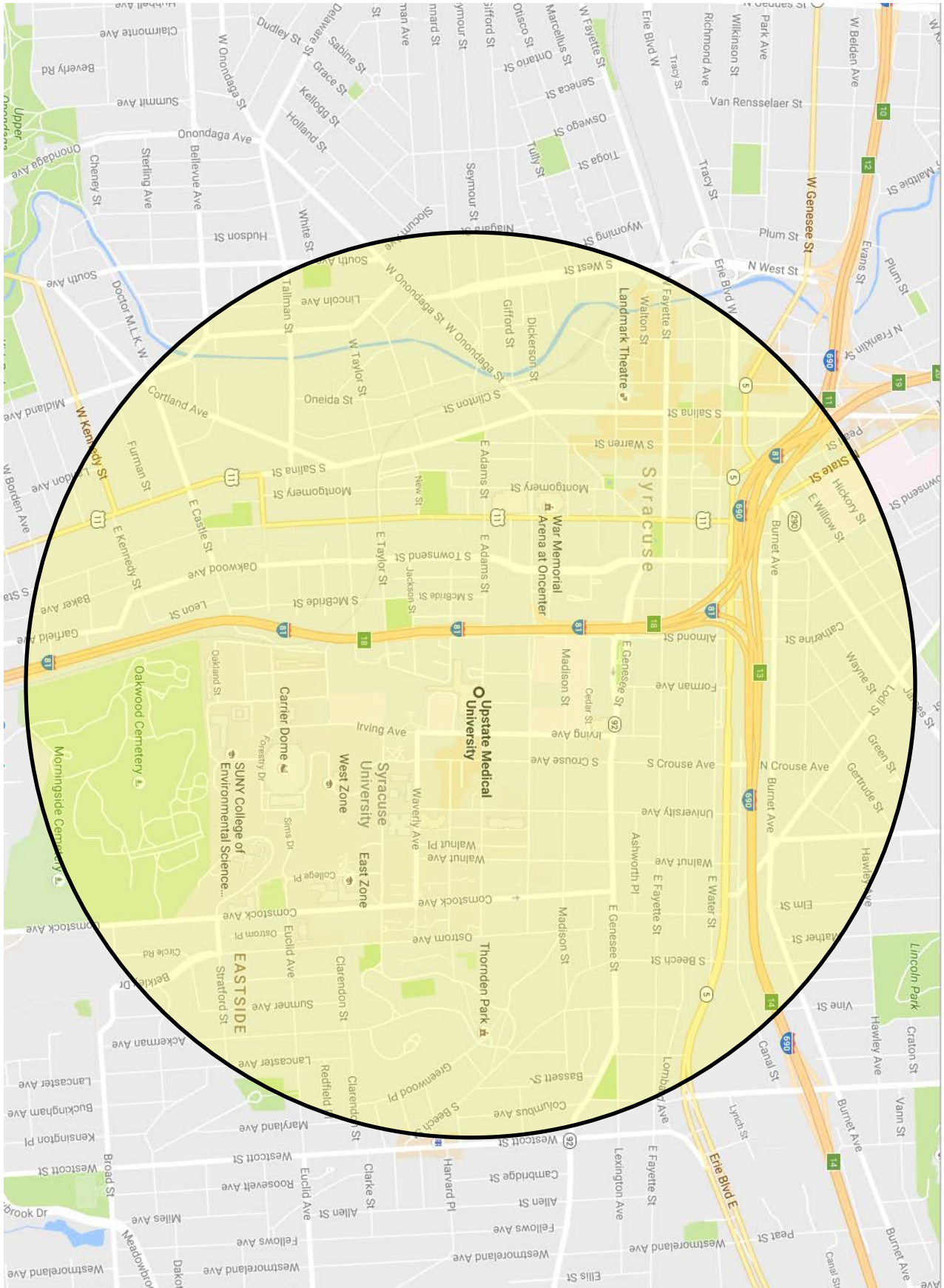
This map illustrates a one (1) mile radius around Upstate University Hospital