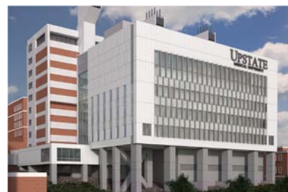
The New Academic Building