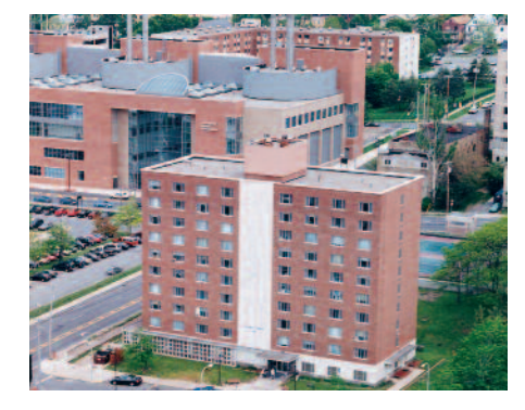
Institute for Human Performance and Clark Tower Residence Hall