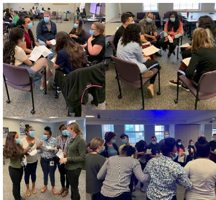
Pictures are worth 1000 words but the short attached movie clip really tells it all!

On 10/21, in place of their regular weekly conferences, the residents were stolen away to Setnor for a three-hour team-building workshop. The floors have been crazy (residency is crazy anyway) and the program directors thought that a little collective break would be good for all. There were several different teambuilding activities and, of course, lunch! The residents had fun but also ended up with a renewed appreciation for each other.