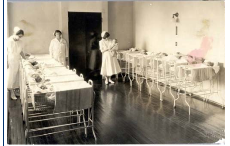
(Crouse-Irving Nursery – 1924)

University Hospital opened in 1964 on East Adams Street, but it had previously been on the campus of Syracuse University for many years. Children were not hospitalized in that building, which is currently is part of the SU School of Education.