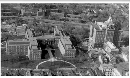
(Site of the future State University Hosp)

University Hospital opened in 1964 on East Adams Street, but it had previously been on the campus of Syracuse University for many years. Children were not hospitalized in that building, which is currently is part of the SU School of Education.