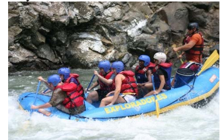
Caption: I am the one in the second row from the front towards the rock wall. This is my first whitewater rafting trip ever on the Pacuare River in Costa Rica

During the summer before my senior year of college, I spent 6 weeks in the Southeastern Amazon in indigenous territory where I: slept on a hammock (covered by a mosquito net), lived in a big hut that was built just for us, researched the attitudes towards death and dying of the Kayapo in Gorotire (the indigenous group), ate fried beetle larvae (tasted like popcorn), helped save my hut from crash and burn agriculture by pouring water all the way around it, almost fell to my death from a mountain, and thus ignited my interest in traveling. I have since traveled to Costa Rica (where I went whitewater rafting for the first time), Belize (where I went fishing for the first time and caught a barracuda on my first try), Hawaii, Puerto Rico, Portugal, Spain, Italy, and France. I am looking forward to a birthday trip to Vietnam and Cambodia with friends in May 2019.