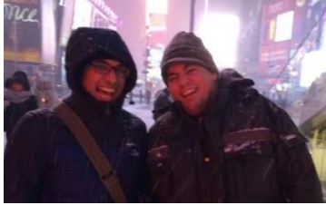
Caption: Braving the cold and snow with one of my best friends in NYC.

seeing the breadth of pediatrics and wanted to pursue hospitalist medicine. I have worked in various venues since then including as a pediatric nocturnalist at Memorial Sloan Kettering Cancer Center, a staff pediatrician at Kaiser in Portland, OR, and a pediatric hospitalist at Albany Medical Center and most recently at NYU. I decided on Syracuse because I felt like it was a great fit for me professionally and, although I enjoyed NYC immensely, I wanted a place where I could put down roots and eventually raise a family.”