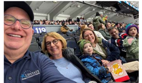
Proceeds from the team's GiveSmart auctions were given to the GCH.