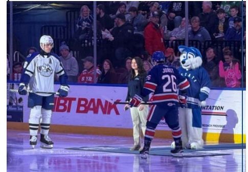
She was cheered on by her delighted fan club.