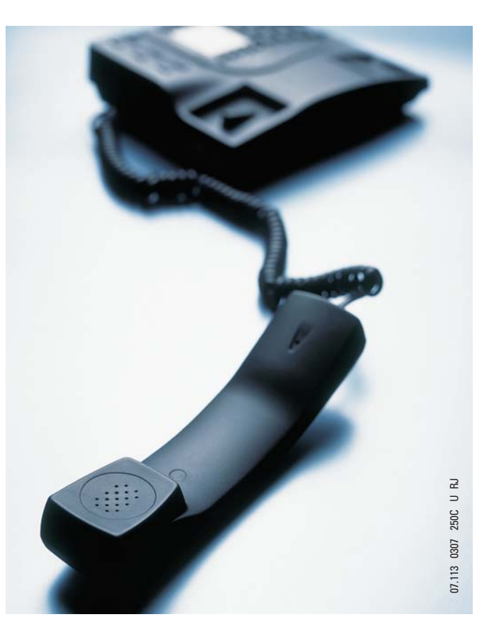
This brochure was developed by University Hospital's In-Patient Psychiatric Unit.

This directory is not considered all inclusive. Additional community services are available. Please check your telephone directory for more information.