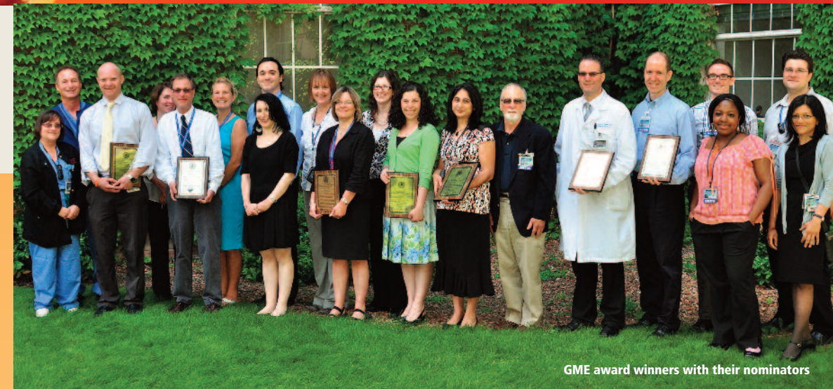
GME award winners with their nominators