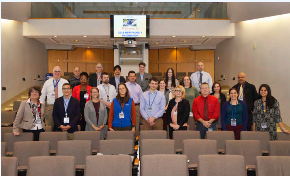
New Faculty 2019 Orientation