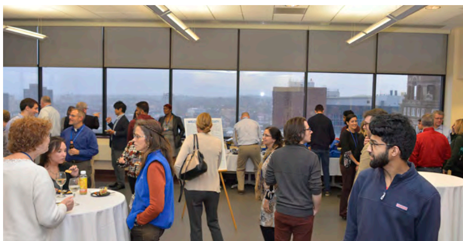
2019 New Faculty Orientation

Buttons and bolded/underlined words are linked to documents and websites. To get the most from this Newsletter, click the links!