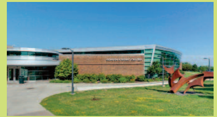
Onondaga Community College