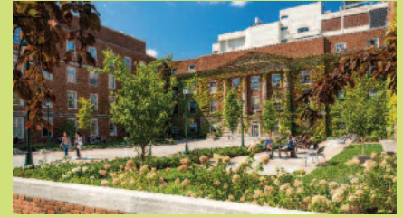
SUNY Upstate Medical University