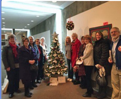
Board members with "It Takes A Village" at the Everson Museum Festival of Trees

I want to use this opportunity to wish all our members, contracts and friends in the Upstate community a Happy and Holy Holiday. In whatever way you celebrate, I hope you are surrounded by love and generosity of spirit. May the New Year bring you peace and prosperity.