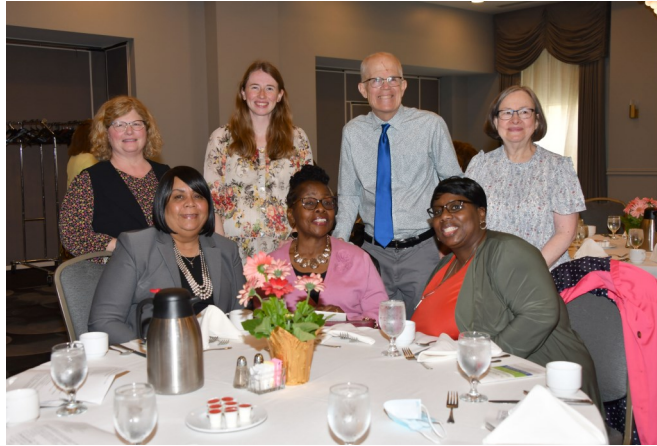
Spiritual Care Department, an Advocates grant recipient, brought a strong contingency to the 2022 annual meeting