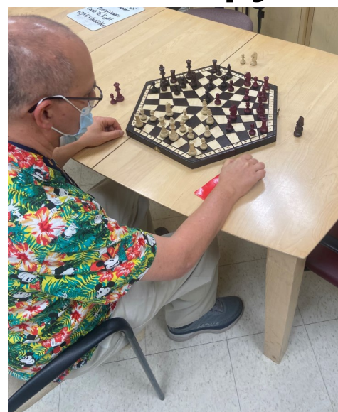
Transitional Care patient develops skills paying three-way chess