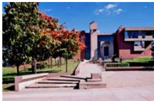
Campus Activities Building

When I was hired, in 2018, we were in Room 1401 in University Hospital. The subsequent lobby remodeling totally redesigned that hallway and we were moved to Jacobsen.