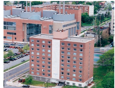
Institute for Human Performance and Clark Tower Residence Hall