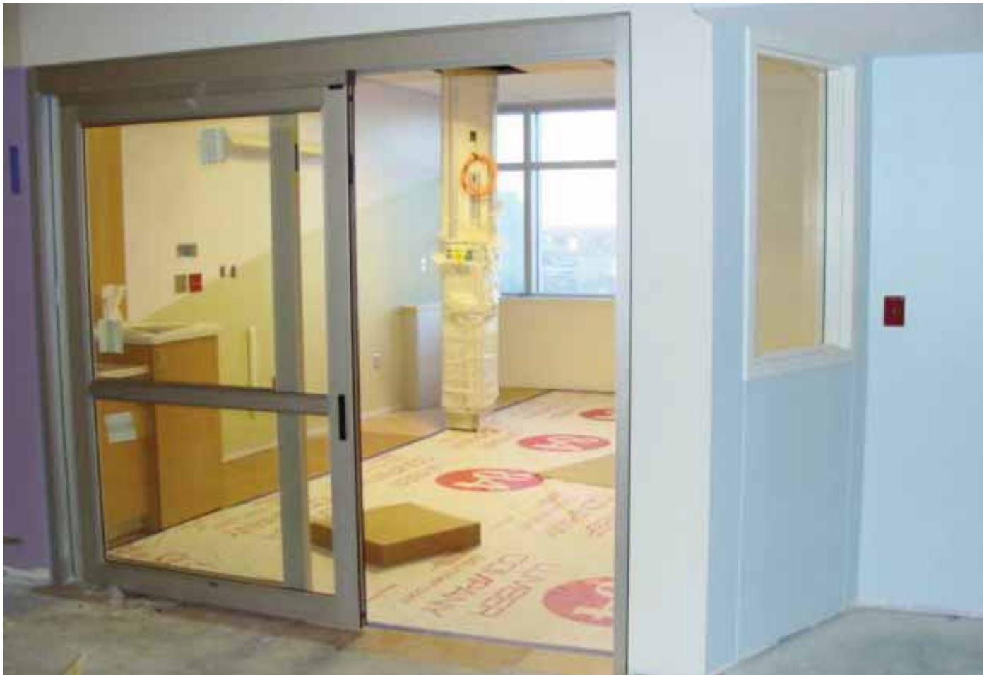
An adult patient room in the intensive care unit nears completion. The alcove at right will house the caregiver workstation.