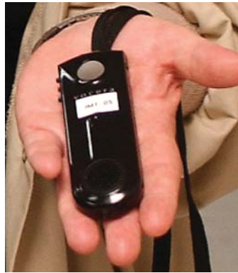
The Vocera enhances communication among hospital staff

Subtle is how the system communicates. It does away