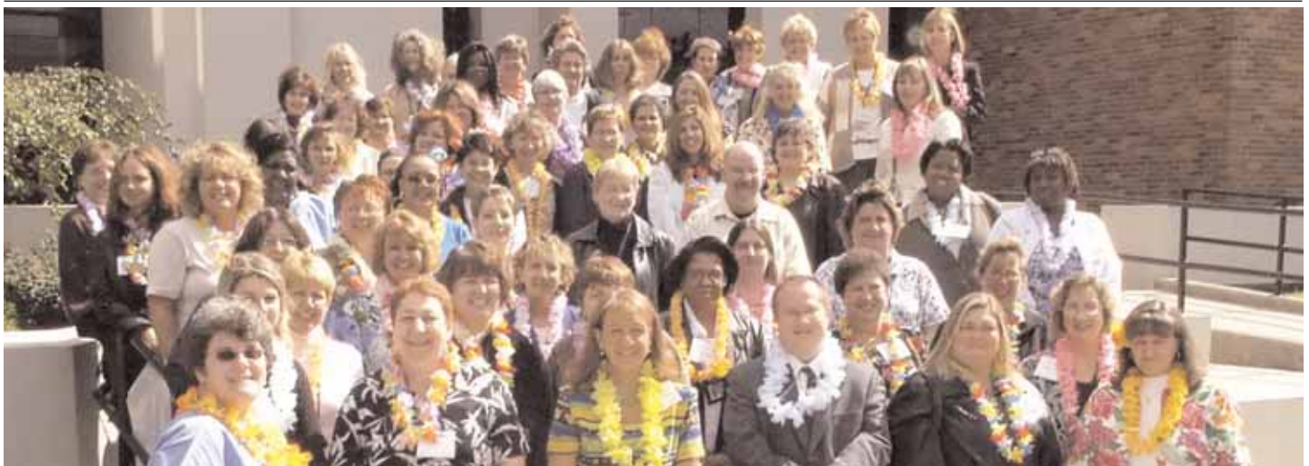
SUNY Upstate Medical University Community Giving Campaign department representatives