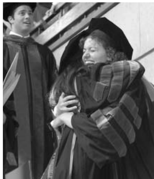
Right: Graduates congratulate each other at the post-Commencement reception, held at the Institute for Human Performance.