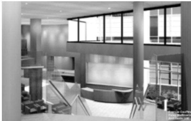
Computer photos of the new parking garage and footbridge (above) and the two-story lobby (below.)