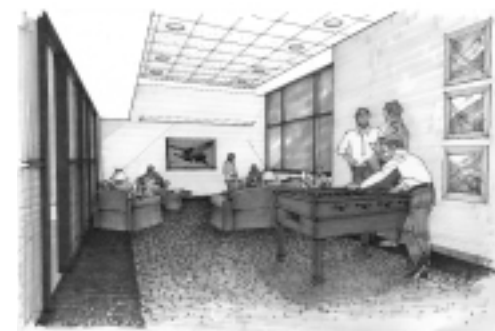
Proposed ninth floor Student Lounge

The auditorium will receive new carpet, seats and desks with power connections at each seat for use with laptop computers. Improvements will also be made to the auditorium's audio-visual equipment as well as the heating and air conditioning systems.