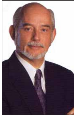
Russell Barkley PhD