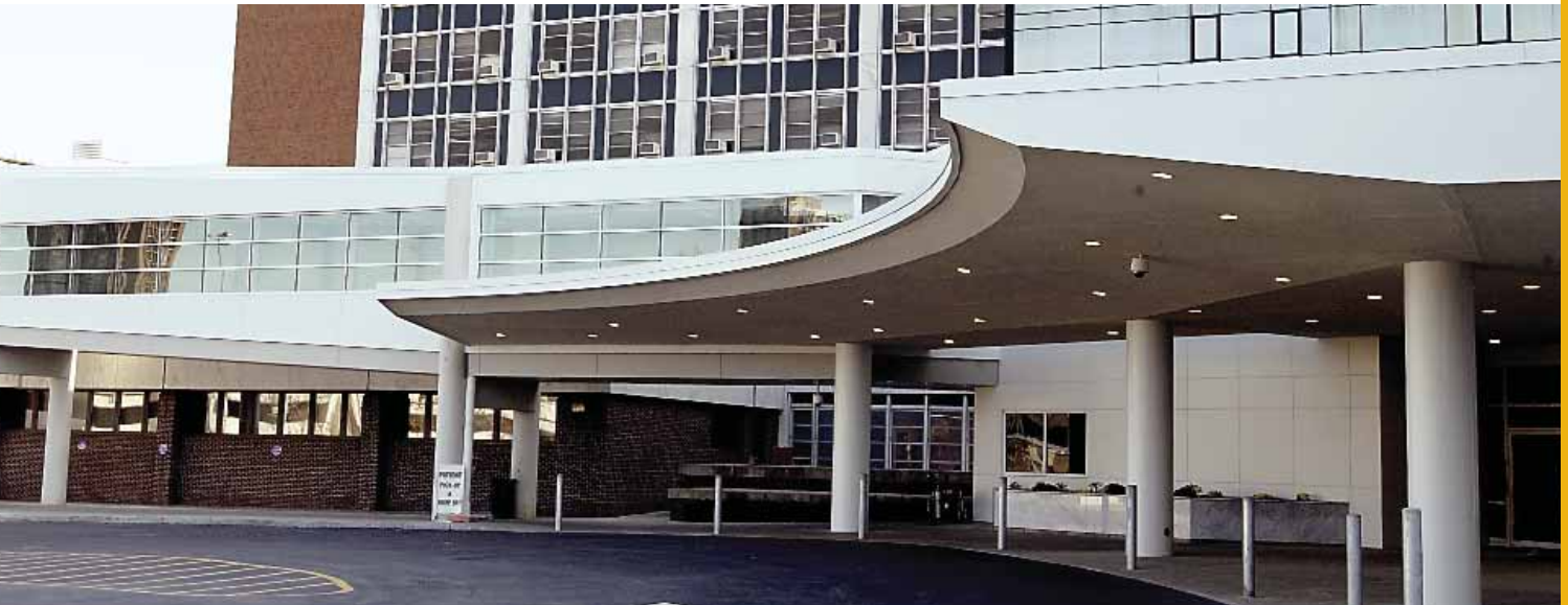
University Hospital, Syracuse, NY

Among its many functions, the Commission on Cancer sets standards of quality for patient care and surveys facilities to evaluate compliance with 36 standards set by the commission.