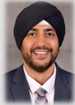
Dr. Raman Singh