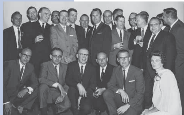
The Class of 1957 at their 10-year-reunion.