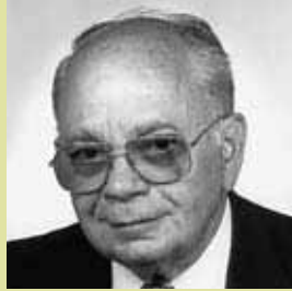
Irwin M. Weiner, MD, Classroom

College of Health Professions Alumni Association College of Nursing Alumni Association