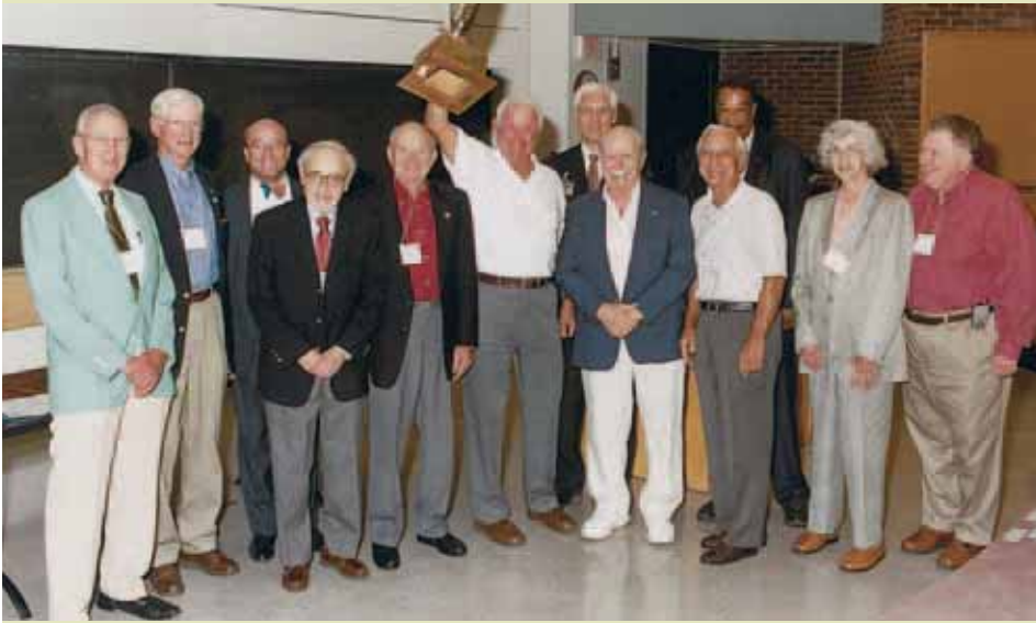
Members of the Class of 1955 celebrate their award for the highest percentage of attendance at Reunion 2005, their 50th class reunion.