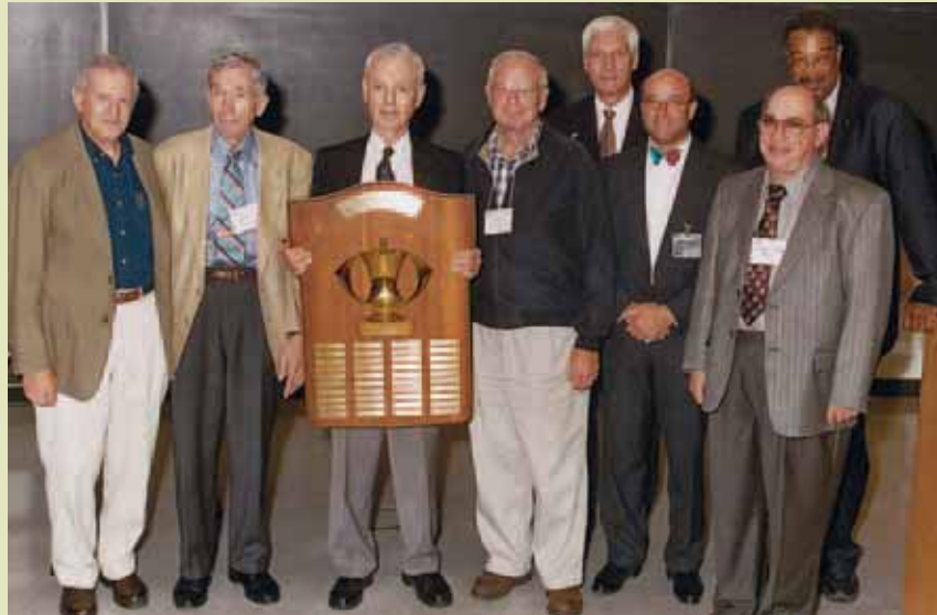
Members of the Class of 1960 celebrate their award at Reunion 2005 for the class with the highest percentage of giving in 2004-05.