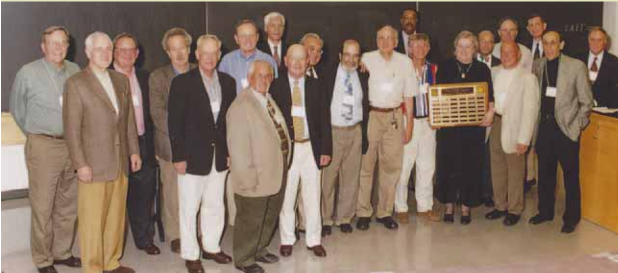
Members of the Class of 1965 celebrate their award at Reunion 2005 for the making the largest class gift during 2004-05.