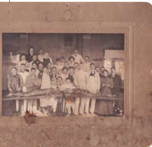
The Class of 1901 in the Anatomy Lab.