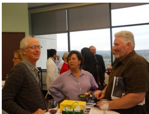
Enjoying the New Faculty Reception