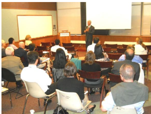
A warm welcome from the President