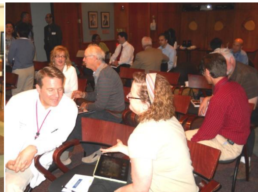
Getting to know new colleagues