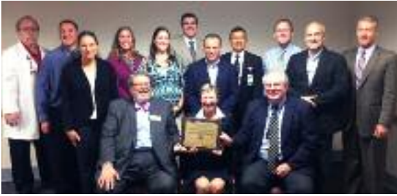
Oswego Health was recognized for participating in the Rural Medical Education Program for 25 years.

Upstate's Rural Medical Education program celebrates its 25th anniversary this year. It was introduced by the Department of Family Medicine in 1989 to help alleviate the state's ongoing shortage of physicians who practice general medicine in New York's rural communities. Since then, 215 students have graduated from this program.