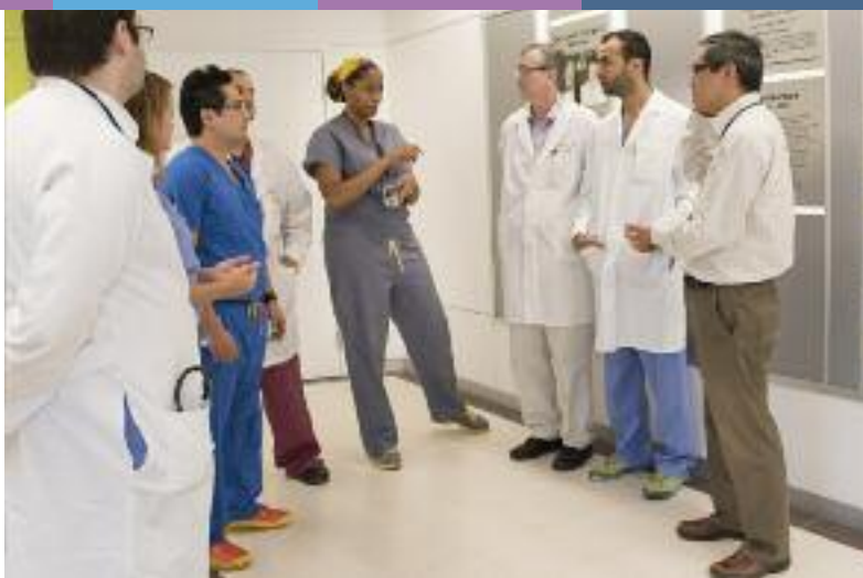
Above left: Communication centers are in each neuroscience unit of Upstate's East Tower. Nursing stations are between each patient room. Above right: Neurosurgeon Lawrence Chin, MD, (right) leads daily patient rounds which includes neurosurgery, neurocritical care and neurology. This includes nurse practitioners, case managers, social workers and staff from occupational therapy, dietary, and speech therapy. Below: Patient rooms have innovative towers that move monitoring equipment away from the traditional location to allow easy access to the patient's head. Each patient has a private room with space for family.

medications to carefully control blood pressure, says Gene Latorre, MD. Other times, surgery is indicated. Surgeons may place clips at the base of the aneurysm, or they may place platinum micro-coils inside the vessel to act as a mechanical barrier to blood flow.