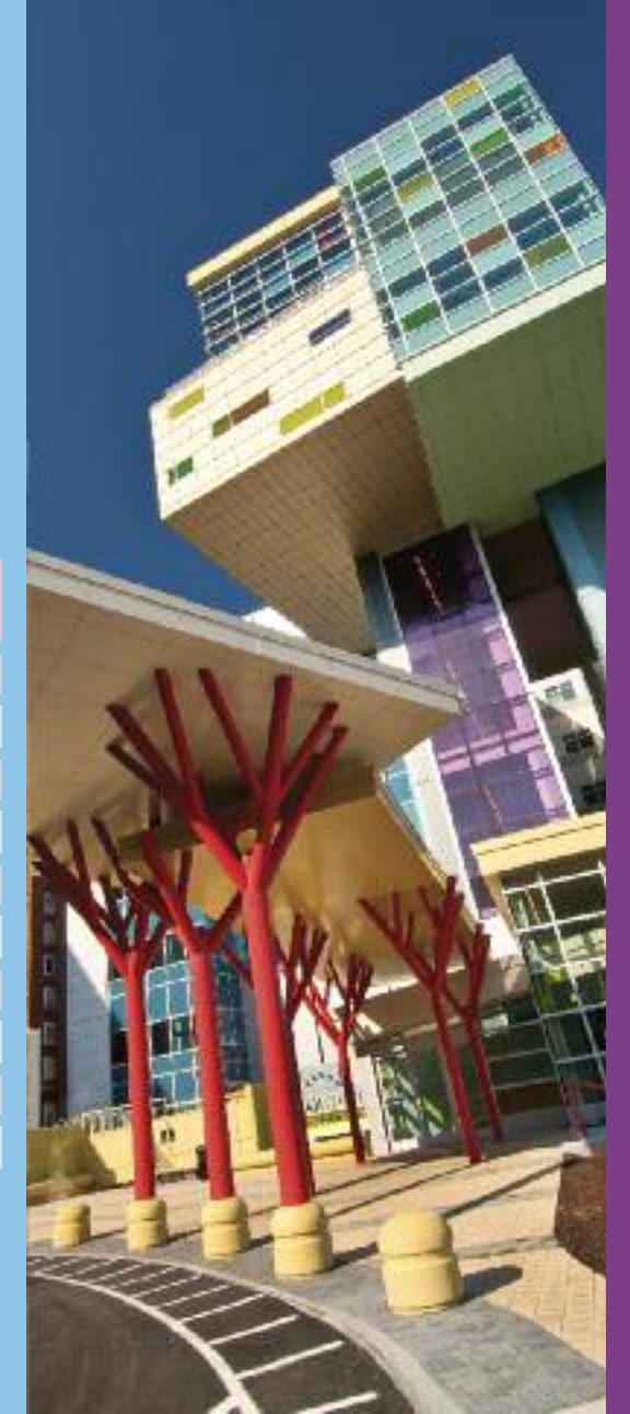
The Upstate Golisano Children's Hospital opened one year ago.