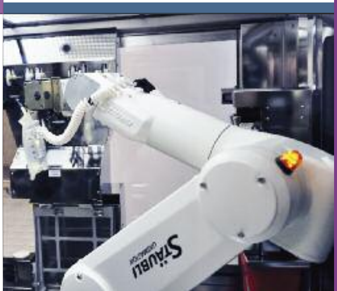
RivA prepares IV medications with precision

RivA is a product of Intelligent Hospital Systems of Winnipeg, Manitoba, Canada. Currently, Upstate is using RivA to prepare non-chemotherapeutic solutions. Ciullo says that Upstate pharmacy has plans to install a second RivA system that will prepare IV chemotherapy medication for cancer patients in the new Upstate Cancer Center, scheduled to open in 2013. ■