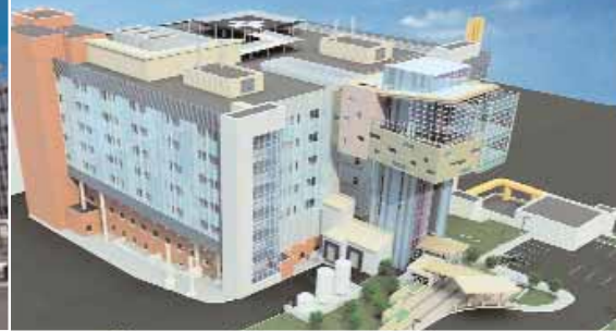
Above far left: SUNY Upstate is dedicated to growing its student body by 30 percent to address our region's critical shortages of caregivers. Above left: Weiskotten Hall: More than one-third* of the physicians practicing in Central New York are graduates of the College of Medicine at SUNY Upstate Medical University. (*1,102 of 3,190 total CNY physicians) Above center: University Hospital: The region's only Level 1 trauma center, this 366-bed hospital has specialty services including the NYS DOH centers for AIDS, burn, poison, sexual assault forensics, stroke and trauma care. Above right: The architect's rendering of University Hospital's vertical expansion, including the Golisano Children's Hospital opening in 2009.