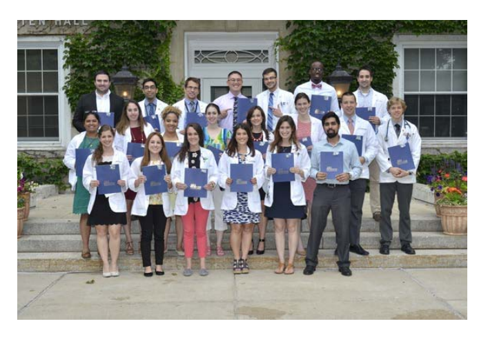
Class of 2018 Student Recipients