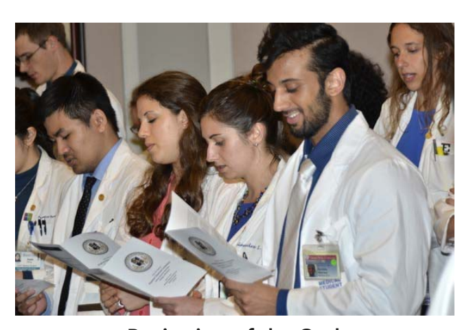
Recitation of the Oath