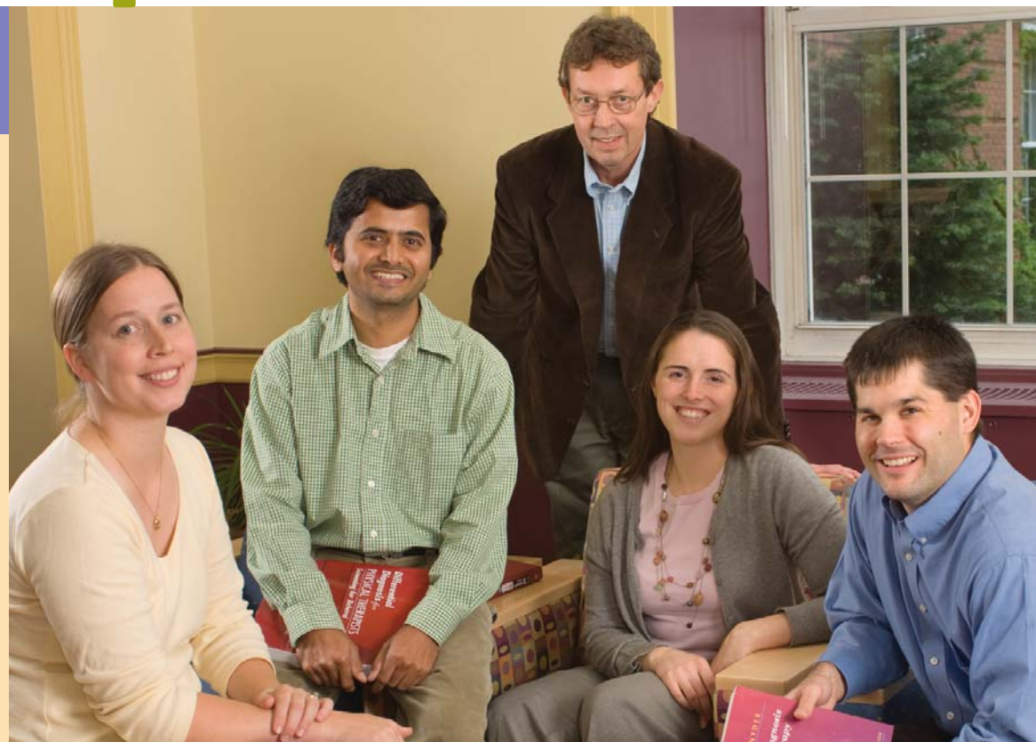
SUNY Upstate physical therapy doctoral students discuss their program. They are working physical therapists who attend the weekend courses.