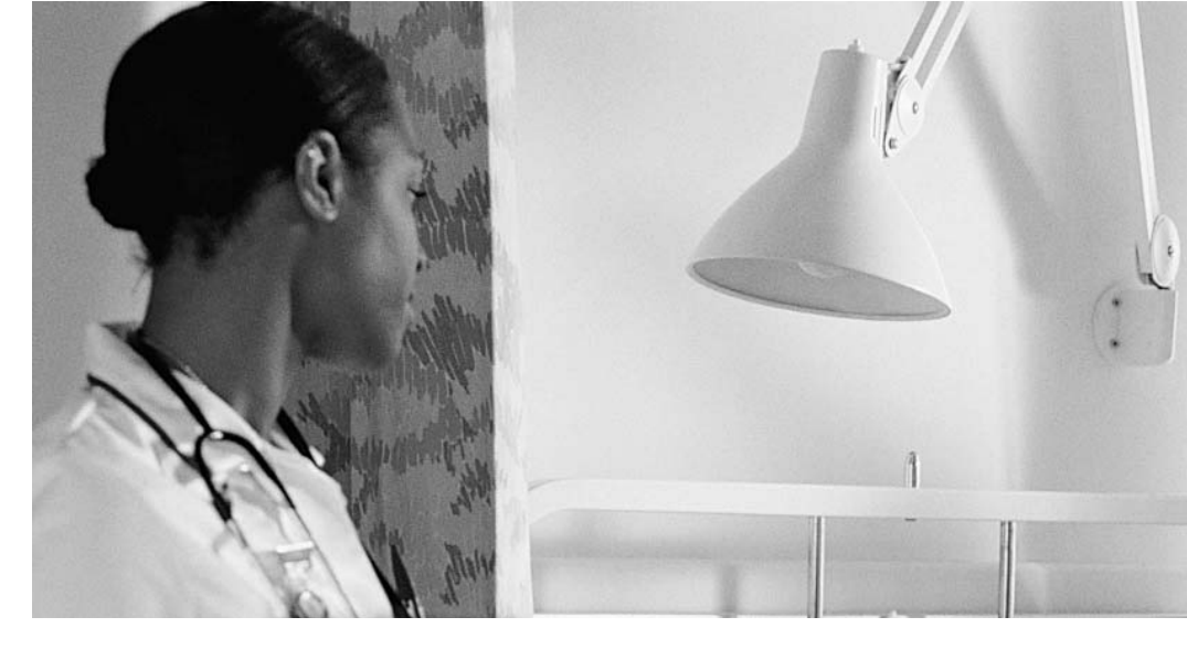
—continued from page 1