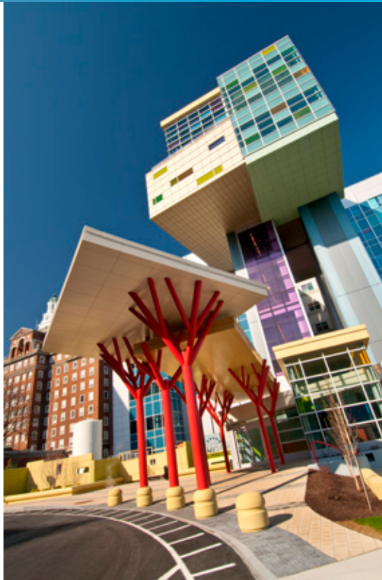
Upstate Golisano Children's Hospital

Upstate investigators have at their disposal beautiful and functional laboratory space that is equipped with advanced instrumentation. The space is located in three dedicated research buildings – Weiskotten Hall, the Institute for Human Performance and our new flagship, the Neuroscience