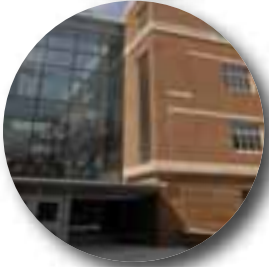
Setnor Academic Building