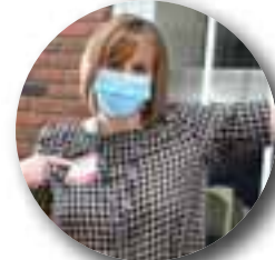
Upstate staff and students step up and host and donate at Upstate blood drives, throughout the year. The donations help maintain the blood supply for our patients and community.