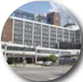
Upstate University Hospital