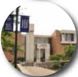
Campus Activities Building